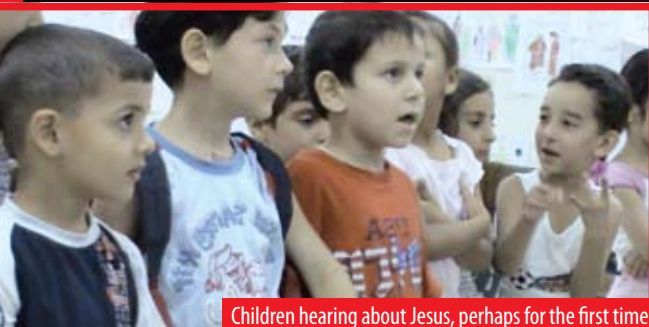
Children hearing about Jesus, perhaps for the first time