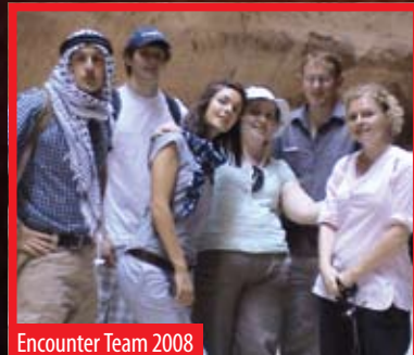
Encounter Team 2008