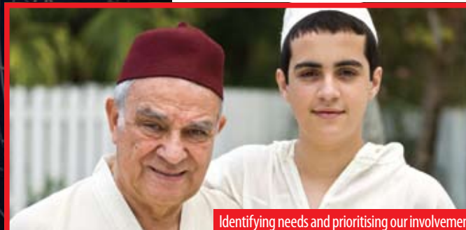
Identifying needs and prioritising our involvement