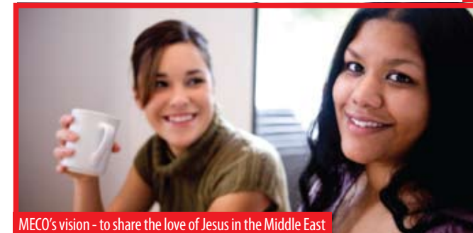
MECO's vision - to share the love of Jesus in the Middle East